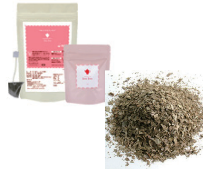
"Product Name: Juju Guava Tea"

A delighted customer's voice: Cured "constipation in a week."